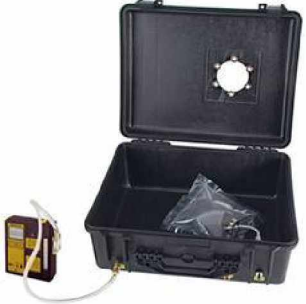
Figure 11: Lung Sampler<sup>1</sup>

The sampling pump is connected to an airtight chamber large enough to hold the Tedlar bag. The valve opening on the Tedlar bag is connected to the sample source. The pump evacuates the chamber containing the Tedlar bag, causing sample to be drawn into the bag from the source. With the lung sampler, contamination issues from a pump (as mentioned in Section 5.1.1) are eliminated.