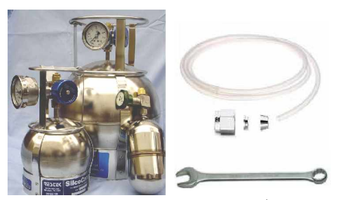
Figure 9: Air Sampling Equipment (canisters, tubing<sup>1</sup>, nut & ferrule<sup>5</sup>, wrench)

1. Make sure you have <u>all</u> the necessary equipment, including SUMMA canisters, gauges, tubing/accessories (if needed), and a <u>9/16-inch wrench</u>. The figure below presents typical grab sampling equipment.