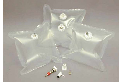
Figure 4: Tedlar Bags<sup>3</sup>

Tedlar bags consist of two layers of Tedlar film sealed together at the edges and a sampling valve. Since Tedlar is inert to most substances, it can be used to collect reactive and more stable organic compounds as long as all sampling components (including the valve) are non-metallic.